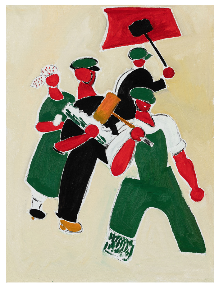
Zhao Gang, "The Northeast" Series-The Socialist Poster, 2020

Cultures in flux tend to nostalgia. Chinese writers in the 1980s described themselves as 寻根, "root-seeking," as they sought to recuperate their heritage after the Cultural Revolution. Sometimes the craving for something real can be desperate. In a society of people and cities that have gotten rich very quickly, many romanticize their working-class origins and the associated lifestyle characterized by simplicity and teamwork. There is a certain movement among art world people who are looking for answers in the countryside. Painter Liu Xiaodong's oil portraits of his hometown, Jincheng, shown in 2010 in Hometown Boy at Ullens Center of Contemporary Art, Beijing, depict the same northeastern heartland that Zhao visited. In towns such as Hengdaohezi or Heilongjiang, a nearly abandoned railway junction in Manchuria, a hotel room costs 15 euros a night, the waitress is friendly, and you can spend days exploring with a curiosity that has been absent for decades, painting everything you see.