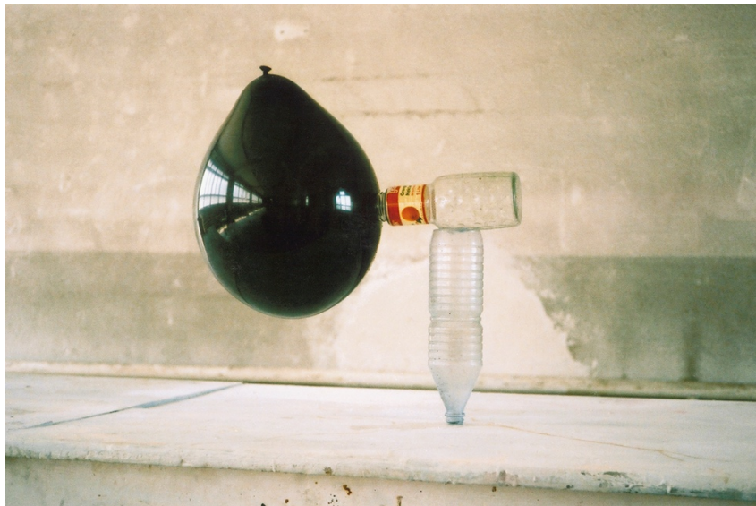
Peter Fischli and David Weiss, Artificial Intelligence , 1984/1986, C-print, 30 x 40 cm, edition 2/3