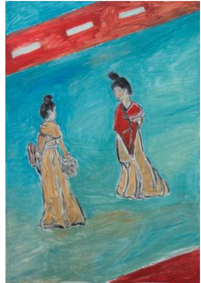
Dialogue , 2016, oil on canvas, 100x 70 cm

The contemporary is never too far away, and as such neither is history or the historical events that will dot future annals. In fact, the Coronavirus series is comprised of 4 works done in Beijing during the height of the COVID-19 viral epidemic across China. In this context, Zhao's practice persisted. In the first of the series, Coronavirus 1 , 2020, a small dark plant in front of a sill, with a window pane divided into sections, reframes the scene into two pieces. Looking out through these panes, a near-void of white freezes the world in place. Cascading sheets of snow blanket roof tops towards a horizon of grey and dead trees. The red flowers of the houseplant pull us back indoors and out of the cold. Taken with its historical context, Zhao puts the very real aspect of separation, isolation, endurance and tenacity of the spirit born in the face of a contemporary crisis into this historical medium and subject.