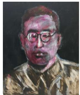
知識份子，2015 - 2017 · 畫布油彩 · 160 x 130 cm