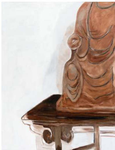
冠狀病毒四，2020，畫布油彩，170 x 130 cm

我們已經不用去分辨這些肖像是趙剛看待自己身份的角度，或是他的敘事方式。近乎所有的作品都被填塞了他的個人歷史與命運。 2015 年至 2017 年《知識份子》與 2016 年《猿王》便提供了我們如此的觀看稜鏡。前者是文化的混合體，後者則是立足在文化出現之前。前者的人物受到了他人給予的殘酷命運，後者則因不屬於人類而倖免於難。無論是身為滿族、藝術家、移民、返鄉者、局內人或局外人，趙剛表現了明確的立場。歷史為證，良善的初衷與知識也不能保證能人類的野蠻中脫身。