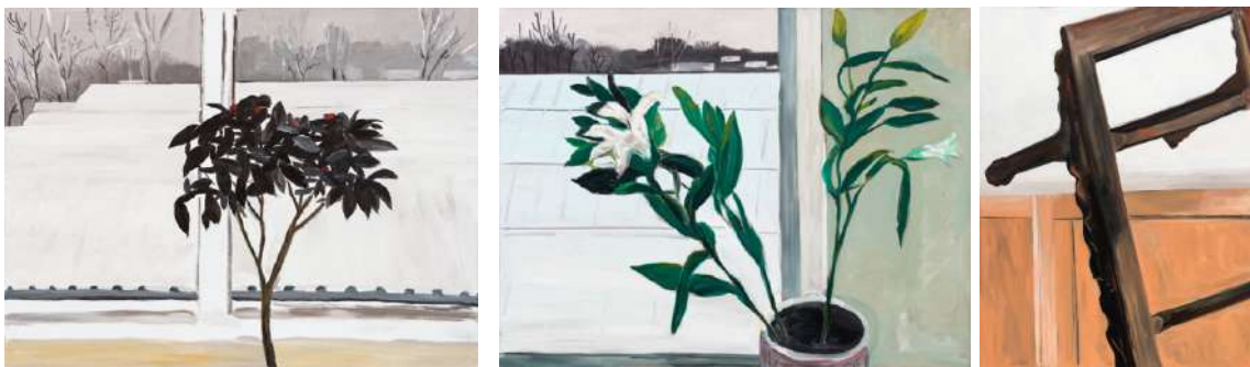
Coronavirus 1, Coronavirus 2 and Coronavirus 3(left to right), 2020, oil on canvas, 130 x 170 cm

Whether these portraits represent aspects of the Zhao's identity or narrative are no longer in question. Almost all of the works are imbued with some piece of his own historical fate. What Intellectual , 2015 - 2017 and Monkey King , 2016 offer us is representation of this spectrum. The former is the amalgam of cultures, the latter predates culture. One figure suffers a cruel fate at the hands of his own people, despite his learning, the other is removed from this strife because it sits outside the troubles of mankind. Zhao makes clear his position on his circumstance, as Manchu, artist, emigrant, returnee, insider and outsider. History has shown, good intentions and intellect do not exclude you from man's barbarism.