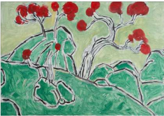
Scene, 2016, oil on canvas, 70 x 100 cm

Born 1961, his family's Manchu pedigree attracted considerable castigation during the Cultural Revolution. As the youngest member of the Stars Group, Zhao Gang contributed to China's earliest modern art exhibitions from the late seventies to the mid-eighties. His activity in a cohort of non-institutionalized artists formed a community of the avant-garde, traveling on bicycles between apartment exhibitions across night-time Beijing. He left China, just before the Anti-Spiritual Pollution crackdowns, to study in the Netherlands in 1983 and later attended Vassar College in the United States. In New York he played a role in pulling not only a community of Chinese avant-garde artists together, but also created spaces for dialogues with African American artists, and even purchased and ran the art magazine Art Asia Pacific for a spell. He lived and worked in New York for over twenty years before returning to Beijing in 2007, to find a new China, and a new topography of Chinese Contemporary Art.