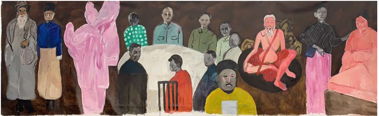
China Party 2020 · 2019 · 畫布油彩 · 320 x 970 cm

隨著趙剛的歸國，他發現他與當時的北京格格不入。為了適應，趙剛繼續了他在紐約所發展出來的個人化創作方法。這種方法圍繞著他獨特的身份，也把視角帶回了歷史、情色、革命、詩意、傳統水墨、與中國過去的文化。如此一來，趙剛從私人的角度描畫了對於新中國的想像，以繪畫探討繪畫本身與自己。