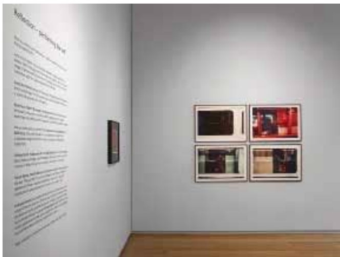
Right: Rasheed Araeen, Christmas Day , 1979, 4 photographs, 51 x 76 cm each.

“Manchester’s early support for the anti-slavery movement,” given it was here that the abolition movement started. 10