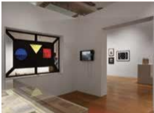
Li Yuan-chia, LYC window , Perspex and wood, inspired by the original window created for LYC Museum by artist David Nash. William Turnbull, Untitled , 1964, screenprint on paper, 52 x 74 cm. Collection of Manchester Art Gallery, purchased from the ICA, London, 1965. Yinka Shonibare, Untitled (Dollhouse) , 2002, wood, fabric and mixed media, 33 x 20.3 x 27.3 cm. Courtesy of Museums and Galleries, City of Bradford Metropolitan District Council, purchased 2005.