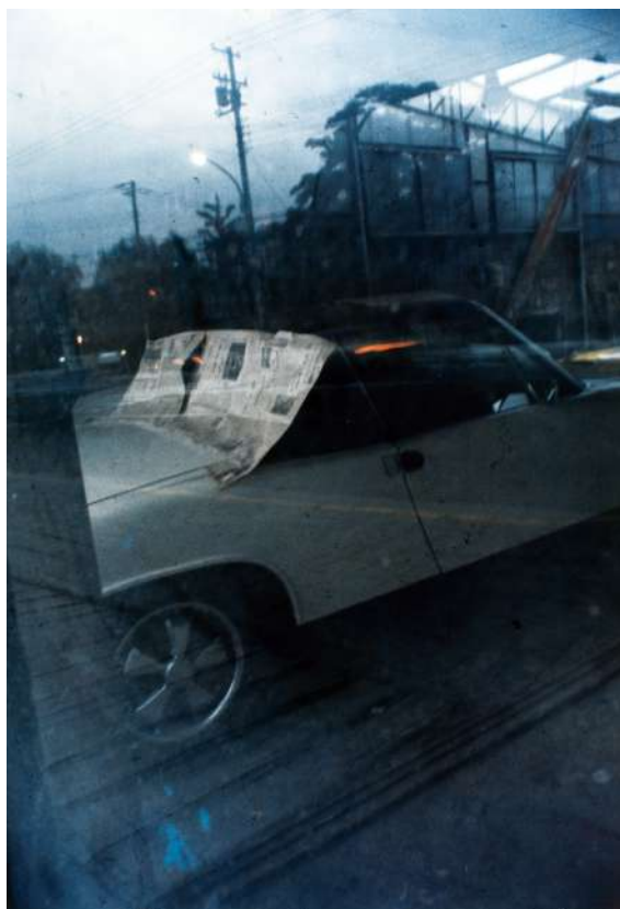
中平卓馬， 氾濫 ，1974，攝影裝置（局部）

氾濫 的首次展出是在 1974 年東京國立近代美術館的聯展「15 人寫真家」中。本作由 48 張彩色攝影拼排在一道長 6 公尺高 1.6 公尺的牆面。這些攝影的內容呈現了一幅都市景觀—怪異氛圍的公共空間中氾濫著各種物件與資訊—這些便是中平卓馬在日常中所面對並拍攝下來的一切，它們可以是牆上蔓延的藤蔓、路面上的水溝蓋、大貨車的輪胎、在水族館黯淡玻璃後浮游的大白鯊、甚或某個車站的近拍特寫。法蘭茲彼查特曾在 氾濫 作品集的序文寫到「 氾濫 迫使觀眾得以與那些看似隨意佈局的片段、表象、殘留物互動。通過如此，我們能理解到不完整整體中的相同例證。」在 1977 年，中平卓馬因嚴重的病痛而導致失憶與失語，並深深的重擊了他的創作以及理論思想。隔年，他便又重新開始拍攝他在路上的日常所見：火、水、鳥、動物、樹、花、車輛、貓、與路人，而如此的創作更加強了他對攝影的超現實與無情感觀點。中平卓馬在自己的著作與攝影中不斷的追求挑釁，而這樣的影像是他的終極表現：攝影的本質只是一個等值的記錄。這些刻意捨棄傳統美學的影像雖然被專業沖印，但仍擁有中平卓馬的標誌性風格與技術。少部分作品的背後有攝影家親手寫下的文字紀錄。