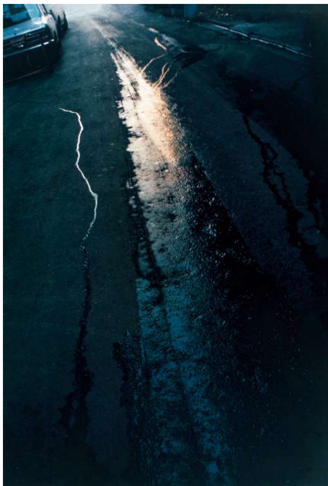
Nakahira Takuma, Overflow , 1974, photographic installation(detail)