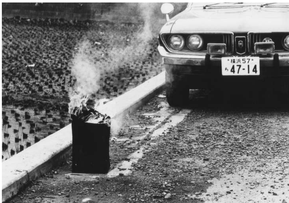
中平卓馬， 無題 ，1980s，來自《中平卓馬 1000》