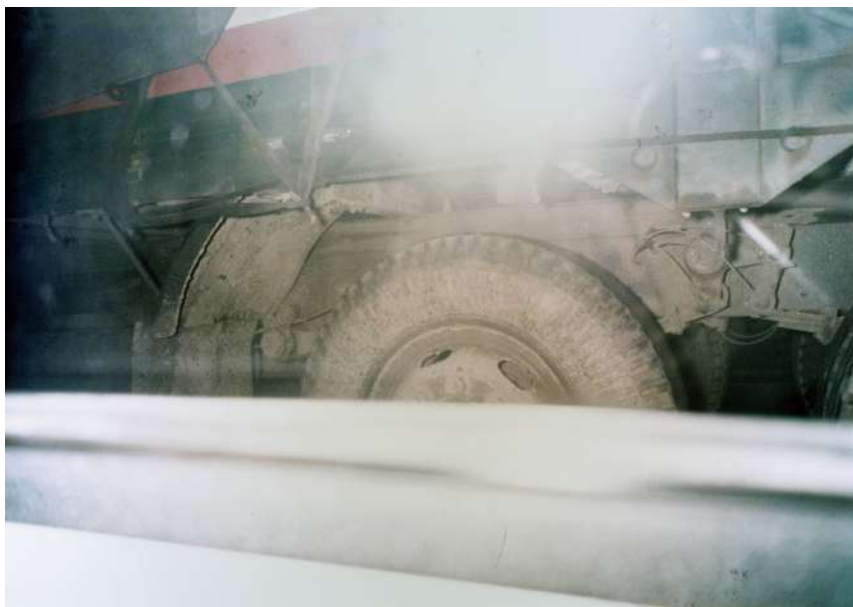
Nakahira Takuma, Overflow , 1974, photographic installation(detail)

"Nakahira Takuma: 1974 to 1989" will be on display at Each Modern from 23 July to 24 August 2019. The exhibition will also feature a special guest lecture from the director of Nakahira Takuma's estate, Sawada Yoko, on 27 July at 3:00PM at Each Modern. On the gallery's second