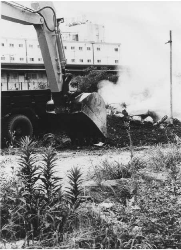
Nakahira Takuma, Untitled, 1980s, from "Takuma Nakahira 1000"

floor, NITESHYA BGTP - Book Gallery Taipei will be featuring a special selection of rare books to coincide with "Nakahira Takuma : 1974 to 1989."