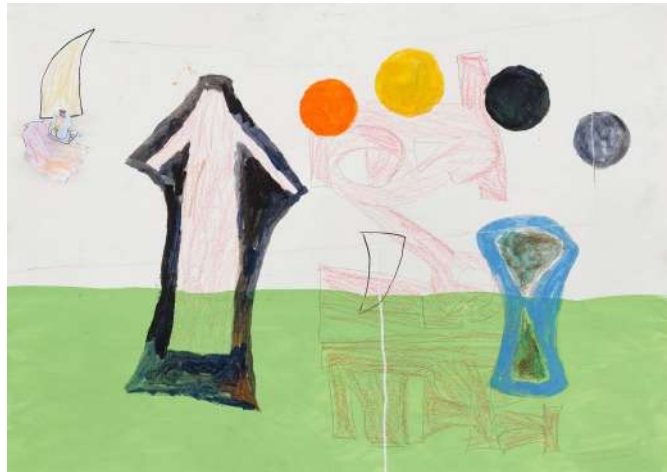
Lin YiHsuan, Untitled , 2018, Oil, oil-based paint, and spray on paper, 38.3 x 56.5 cm

Li Yuan-chia and Homages To seeks to bring unexplored histories to the surface through connections made in the present in new and unimagined ways. In collaboration with The Li Yuan-chia Foundation, Each Modern presents an exhibition that invites visitors to stand before new and emerging cosmic points.