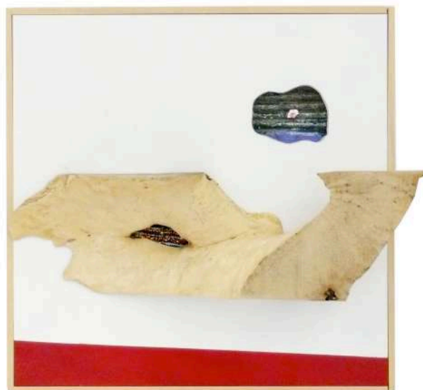
李元佳, 無題, 1994, 顏料、照片、木板, 62 x 64 cm

此次展出的作品將包括李元佳具代表性的水彩、珍貴的手繪上色攝影、木頭浮雕裝置等。除亞洲已非常收悉的東方畫派時期、波隆那時期以外，倫敦時期、坎布里亞時期的精品，將首次在台灣商業畫廊中呈現。另外，李元佳基金會的宗旨在於推動世人對李元佳藝術的理解—尤其是年輕世代：因之 Each Modern 以畫廊極擅長的對話手法，邀請具居住海外經驗的年輕藝術家，創作與之對話的作品，包括張碩尹、周世雄、藍仲軒、林亦軒、吳權倫、許炯，以及一部英國導演 Helen Petts 製作的電影「 Space & Freedom 」。